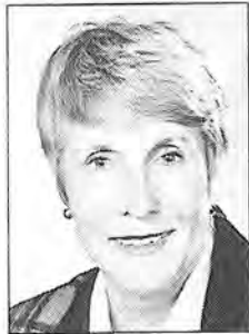
The Hon D Grusovin MP Vice-Chairperson