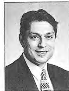
The Hon J Hatzistergos MLC